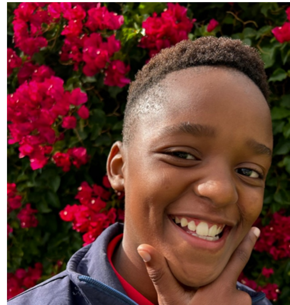
INTERMEDIATE PHASE EJ MBELE