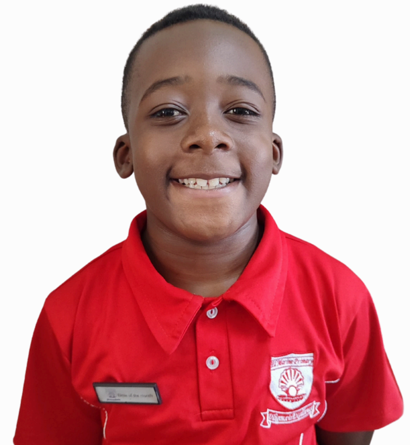
Intermediate Phase: Duke Edward